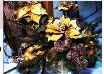
This centerpiece was available for bid at Perceptions annual Holiday

We'll be happy to put your holiday picture in the newsletter. Contact editor@perceptionssv.org and let us know!