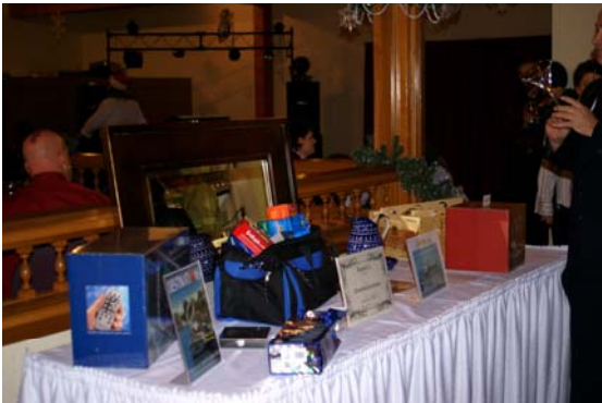
Some of the live auction items on display.

out for the 5th annual Holiday Party. Guests browsed over 80 auction items and enjoyed a buffet dinner followed by a live auction and then danced until midnight with DJ Alias. As always, the